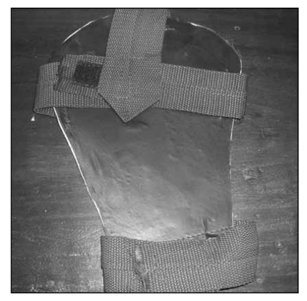
Plate 1: The Final Restraint