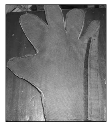
Plate 3: The 2nd Trial Restraint